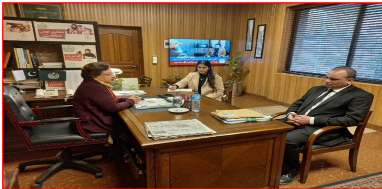
Director LAW with Chief Commissioner Punjab on the Rights of Children

In addition, the Director General of Punjab Probation and Parole Service Punjab and Punjab Chief Commissioner on the Rights of Child had invited Legal Awareness Watch to make them aware of the latest developments on the implementation of Act 2018. Those departments had expressed interest in the topic of juvenile justice and requested LAW to assist and facilitate them in sending recommendations and suggestions to the government/legislature at the federal and provincial levels for their consideration on the implementation of Act 2018.