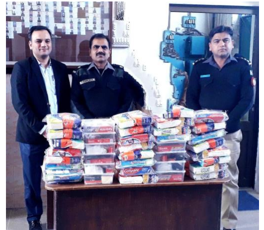
Left: Director Legal Awareness Watch Pakistan, Superintendent District Attock Jail, and Deputy Superintendent of the same jail.

groups, and individuals and those targeting harmonization of overall criminal justice system of Pakistan.